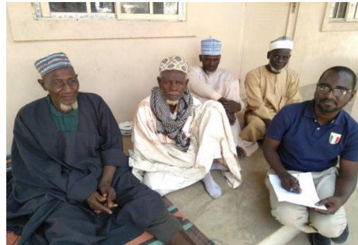
Plate 2: Key informant interview at Dachia Village