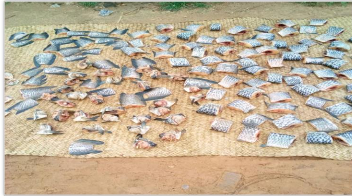
Plate 5. Fish processing