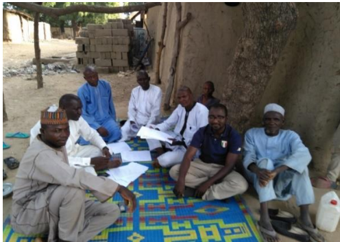
Plate 1, FGD with farmers at Dachia Village Square