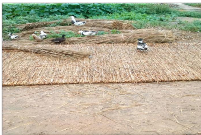
Plate 4. Mat produced from Typha weeds

In the wetland, weeds are largely considered as a threat to crop production as they increase competition for nutrients and water with crops. Weeds are, however, used as raw materials for construction, craft work, medicine, among several other uses. This study investigated the various uses of the identified wetlands weeds in the study area. Respondents reported several uses of the wetlands weeds in the area as shown in Table 2. These include craft work such as waving baskets, mats, and canoes, as can be seen in Plates 1 and 2. Other reported uses of weeds include building materials. Thus, locals use weeds as roofing thatch, fence, clay cementation, etc. Weeds are also used as animal fodder, but some are highly toxic; nonetheless, because animals eat a variety of (composite) weeds, the toxical ones are neutralized. The findings of this study reveal that the weeds are means of livelihood to locales living around the wetlands.