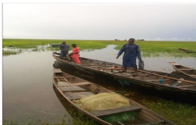
Plate 6. Water transportation on Hadejia-Nguru wetlands

Grace (1989) also reported that edges of Typha grass areas are occasionally used as nesting habitats for snowy egrets, black-crowned night herons, and yellow-headed black birds. In addition, upland songbirds use fluff from the flowers to line their nests. A few species, such as deer, use the stands for escape cover. Farmers in the area are suffering from a lack of irrigation water due to blockage of main channels distributing water to their farms by weeds. They are also facing serious problems all year due to flooding during rainy season caused by the blockage by Typha grass and siltation aided by the grass. This assertion is similar to what was reported by Thompson et al. (2009) that, “excessive flooding caused by blockage of river channels and siltation has led to adverse consequences of low productivity of crops, particularly rice.” Hollis (2011) also added that, in some cases, more than 90% of lands, hitherto used for cultivation and grazing, have been overtaken by flood due to the presence of weeds. Typha grass invasion may deplete soil nitrates with resultant poor crop yields which will require the use of artificial fertilizers and pesticides. Furthermore, if these chemicals are added in excess quantities, they will percolate into the ground water supplies, flow into streams and rivers, and trapped by Typha grass. This may have effects on aquatic and marine life ecosystems, and may lead to public health problems, when the water is used for drinking.