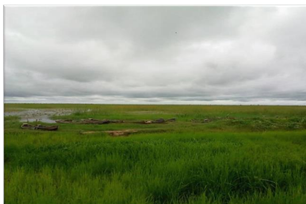
Plate 3. Hadejia-Nguru wetlands weeds (Field observation and measurement, 2019)

Of all the weeds listed in Table 3 above, Typha and Echinochloa pigram are the dominant weeds that colonized the wetlands, as reported by all the 12 focus groups, which they locally called as Kachalla. The time line history with the key informants revealed that the weed's secondary succession started in 1973, that was during Sahelian drought. The evidence is presented in Plate 1.